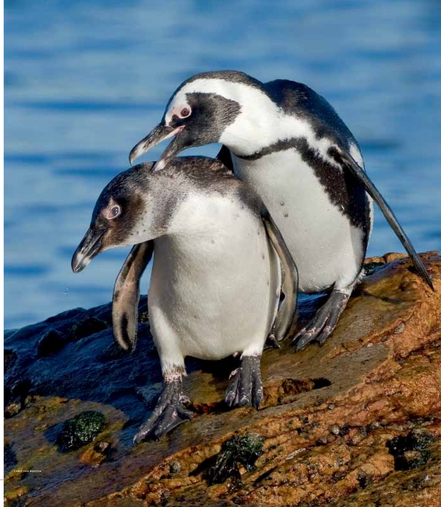
CHRIS VAN ROOYEN

After some initial setbacks, the mainland colony on the south coast at Stony Point, Betty's Bay, has seen rapid growth in recent years. In addition to providing nesting sites for more than 300 pairs of penguins, it is an extremely important moulting location for penguins that have built up their fat reserves on the abundant pelagic fish in the area. ▶