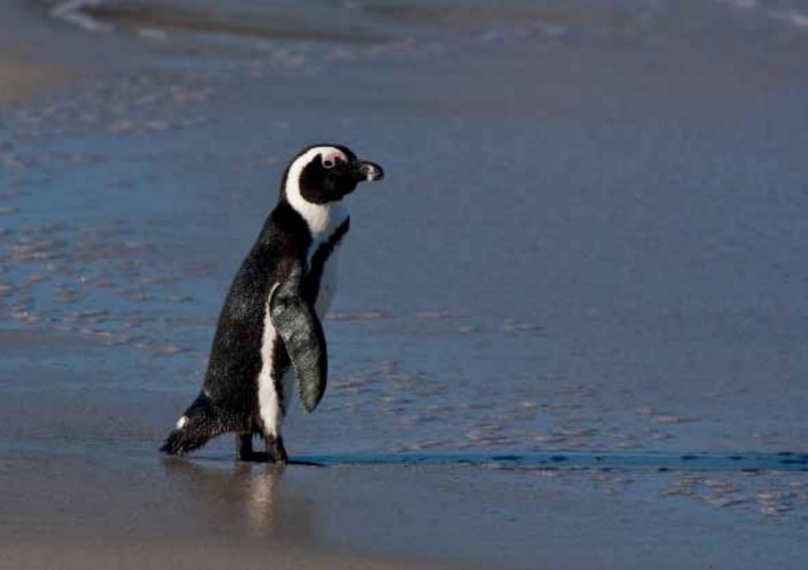
ALBERT FRONEMAN (2)