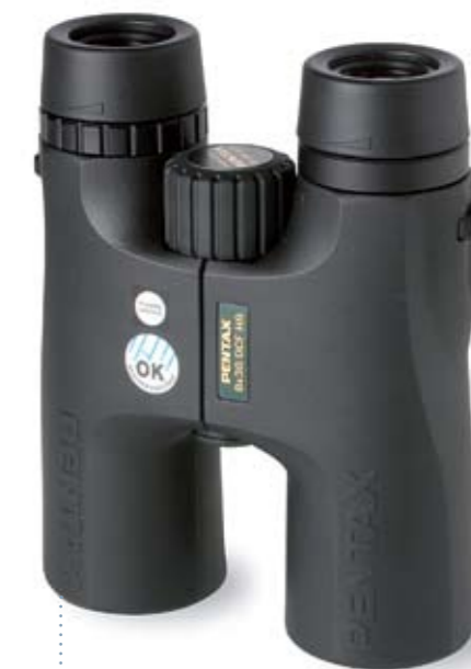
PENTAX DCF HS 8x36

bought 10 or 15 years ago because you think you can't afford to upgrade, do yourself a favour and try out some of these bins. The difference in quality will revolutionise your birding experiences.