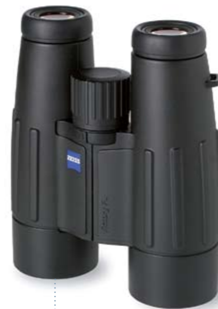
ZEISS VICTORY FL 10x42

Hopefully we've convinced you that roof-prism is the way to go. But now the field gets more crowded. We were faced with 25 pairs of binoculars, ranging in price from just over R1 600 to R19 000. The field here can be divided into three price brackets: the top end (R15 000 and up), mid-range (R7 000–R13 000), and bargain basement (less than R5 000).