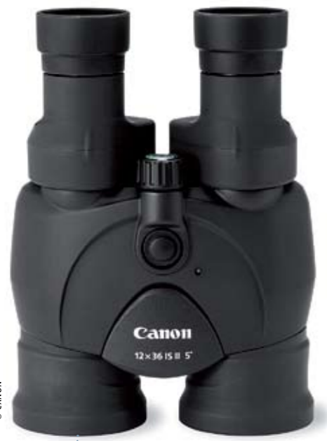
CANON IS 12x36

than an hour of fiddling, the binoculars were ready for testing. Once the panel got down to work, there ensued eight hours of concentrated assessment, as we tried each pair to get an idea of the range of products on offer, then did it all over again to do the actual scoring. At the time, we didn't know the prices of the various products (other than having a rough notion for the top end of the range). All the scores were then combined and each pair of binoculars was given a 1- to 5-star rating for optics and feel. The sum of these ratings was then divided by the cost (using an arcane transformation) to come up with an index of value for money. The results are summarised in the table on page 62.