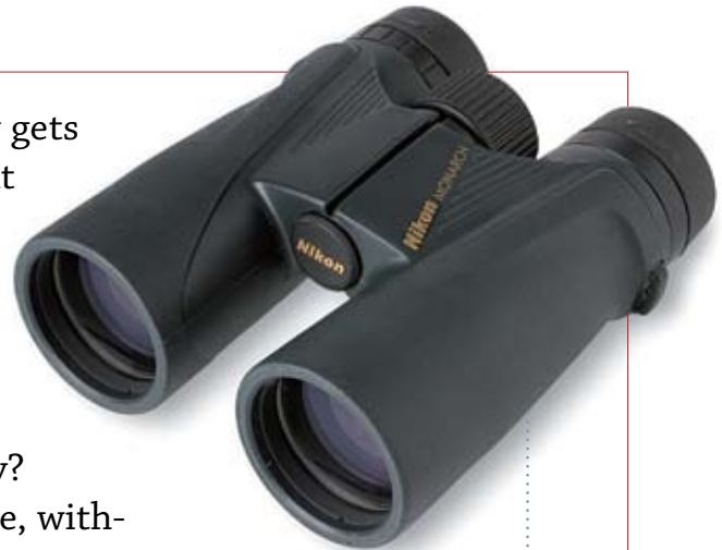
NIKON MONARCH DCF 10x42