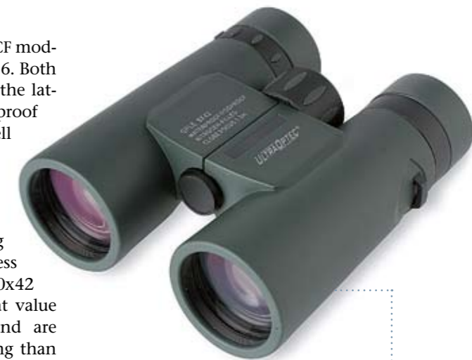
ULTRAOPTEC GAME-PRO 8x42