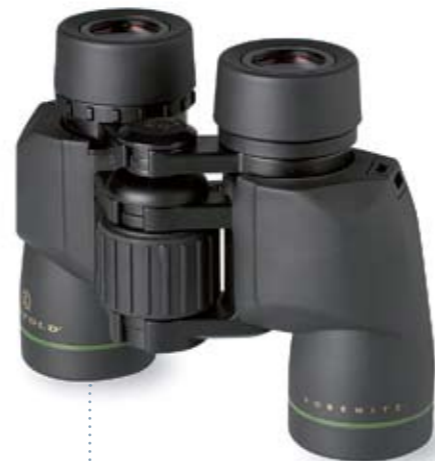
LEUPOLD YOSEMITE 6x30

Of the 36 pairs reviewed, 26 cost more than R1500. The remaining 10 were either porro-prism (big, clunky binoculars) or small, compact bins designed for slipping into your pocket or taking on a hike when weight is a serious issue. The porro-prisms didn't rate too badly for optics, but for the most part fared poorly in terms of feel and robustness. Almost all have external focusing (the eyepieces move in and out to focus), which pretty much precludes them being waterproof, and from experience we have found that they are easily knocked out of alignment. The one exception is the Leupold Yosemite 6x30, which has internal focusing and is claimed to be fully waterproof. It is small, compact and as cute as one can imagine