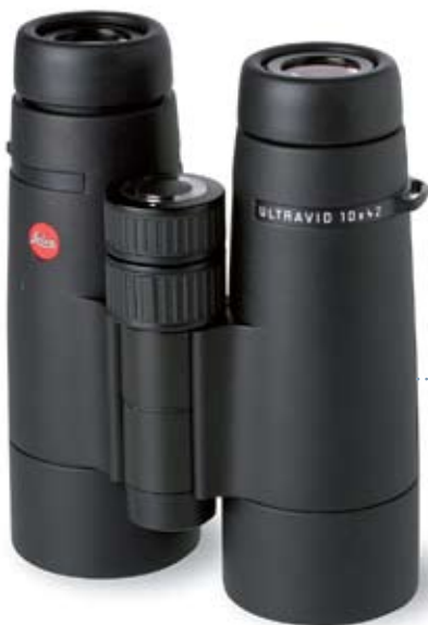
LEICA ULTRAVID 10x42

The initial plan had been to simulate field conditions by showering the binoculars with water and giving them a few lusty blows. But we were under orders to return them in a pristine state, so we limited our assessment to two main categories: optical performance and 'feel', which combined handling, robustness and appearance. Each was broken down into a number of specific attributes and scored from 1 to 5. Optical quality was rated on brightness, colour rendition, chromatic aberration, flare when looking into the light, width of the field of view, depth of field, the speed of focus action, whether the focus was crisp, and whether the image was flat and sharp across the entire field of view. We also measured the close-focus distance to test the manufacturers' claims. The feel of each pair was scored on whether they were well balanced and comfortable to hold, weight, size, whether the focus mechanism was easy to reach and use, whether the strap system and eye-cups were comfortable, ▷