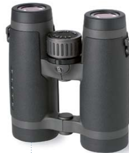
BUSHNELL ELITE 8x43

*The prices shown in this table were correct as at the end of September 2006 – they are intended as a guide only and we cannot take into account import currency fluctuations and retail price increases.